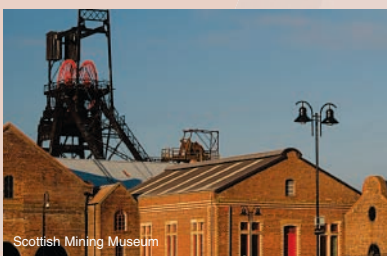
Scottish Mining Museum