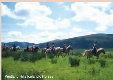
Pentland Hills Icelandic Horses